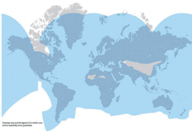
▶ Global Coverage